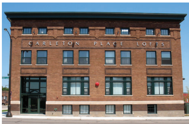
Carleton Place (historic name: Simmons Manufacturing Company), St. Paul, Minnesota (1909). Before and after rehabilitation for residential use.