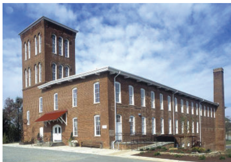
Prizery/R.J. Reynolds Tobacco Warehouse, South Boston, Virginia (1900). Rehabilitated for commercial use.

The NPS or the SHPO may inspect a rehabilitated property at any time during the five-year period. The NPS may revoke certification if work was not done as described in the Historic Preservation Certification Application, or if unapproved alterations were made for up to five years after certification of the rehabilitation. The NPS will notify the IRS of such revocations.