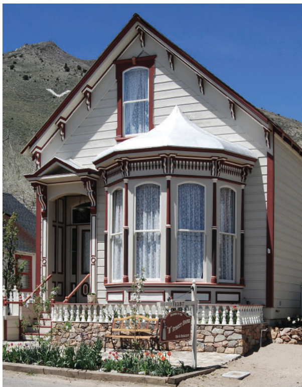
58 B Street, Virginia City, Nevada (1875). Rehabilitated as a bed and breakfast.

The NPS reviews the rehabilitation project for conformance with the “Secretary of the Interior’s Standards for Rehabilitation,” and issues a certification decision. The entire project is reviewed, including related demolition and new construction, and is certified, or approved, only if the overall rehabilitation project meets the Standards. These Standards appear on pages 24-25. Both the NPS and the IRS strongly encourage owners to apply before they start work.