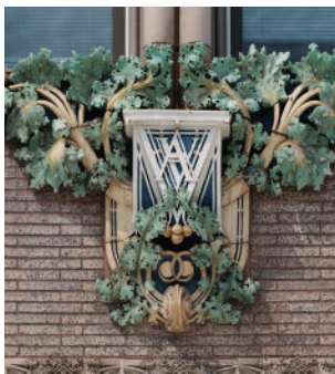
Van Allen and Son Department Store, Clinton, Iowa (1913-1915).