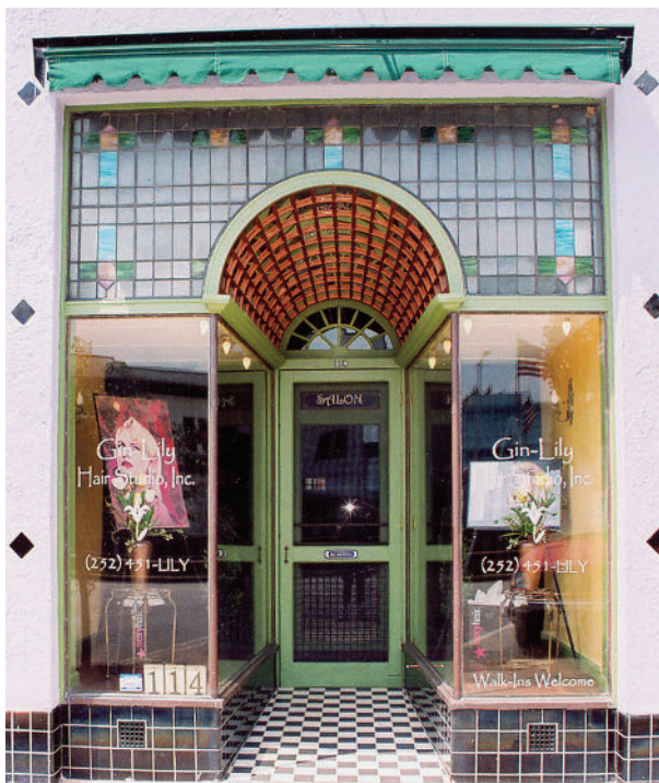
114 NW Main Street, Rocky Mount, North Carolina (1928).