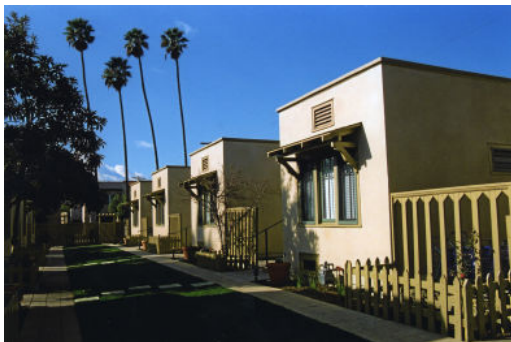
Hollywood Bungalow Courts, Los Angeles, California (1921-1925). Rehabilitated as housing for special-needs and low-income residents.

The NPS charges a fee for reviewing applications. Fees are charged for the review of proposed work (Part 2) and for review of completed projects (Part 3). The fees are based on the rehabilitation costs. Payment should not be sent until requested by NPS. The NPS will not issue a certification decision until payment has been received. See the NPS website on page 26 for the fee schedule.