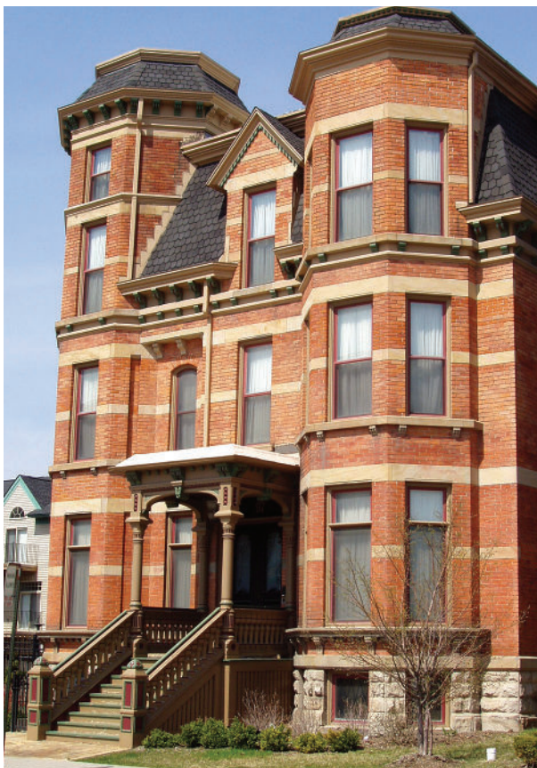
John Harvey House, Detroit, Michigan (1875). (opposite) Before rehabilitation; (above) After rehabilitation as a bed and breakfast.

limited partnerships, cannot be used to offset tax liability from “active” sources such as salaries. This passive activity limitation does not apply to: