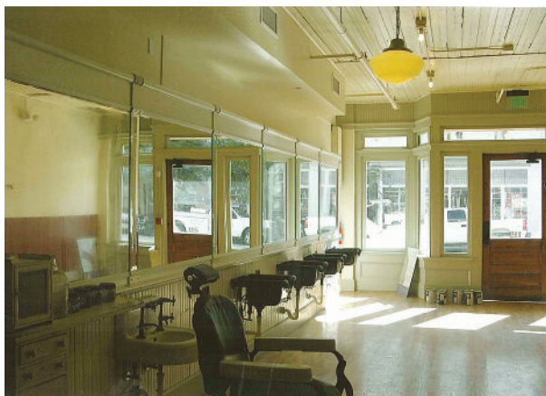
Odd Fellows Building, Raleigh, North Carolina (c. 1880). Rehabilitated for continued commercial use.